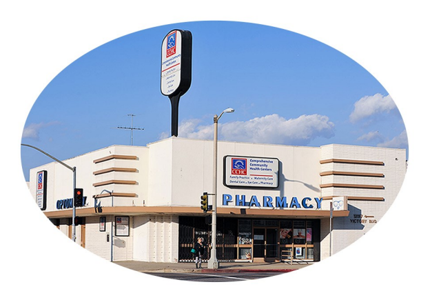
North Hollywood 12157 Victory Blvd. North Hollywood, CA 91606