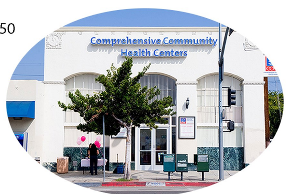
Highland Park 5059 York Blvd. Los Angeles, CA 90042

801 S. Chevy Chase Dr. #250 Glendale, CA 91205