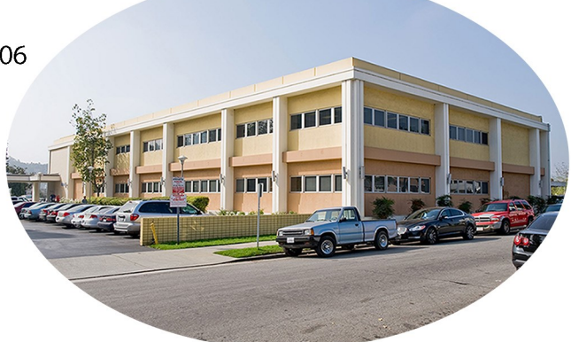
Eagle Rock 1704 Colorado Blvd. Los Angeles, CA 90041