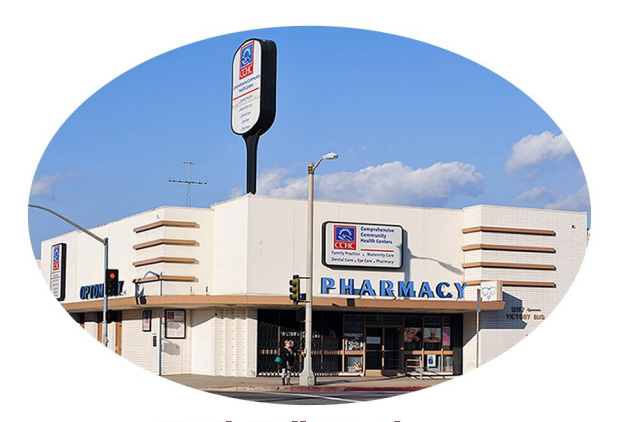
North Hollywood 12157 Victory Blvd. North Hollywood, CA 91606