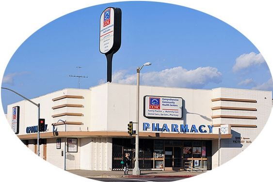
North Hollywood 12157 Victory Blvd. North Hollywood, CA 91606