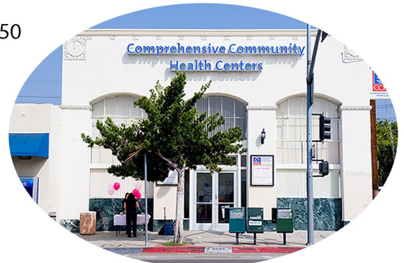
Highland Park 5059 York Blvd. Los Angeles, CA 90042

For more information about our services visit