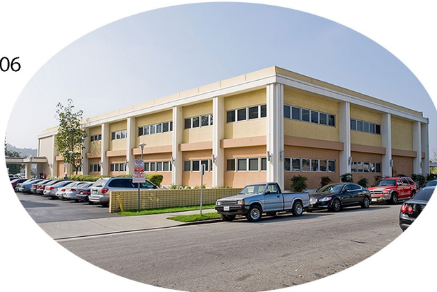
Glendale 801 S. Chevy Chase Dr. #250 Glendale, CA 91205