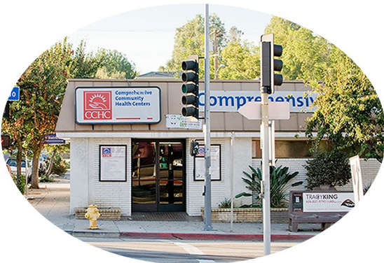
Eagle Rock 1704 Colorado Blvd. Los Angeles, CA 90041