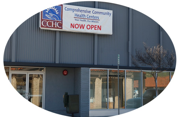
Sunland 8316 Foothill Blvd. Sunland, CA 91040