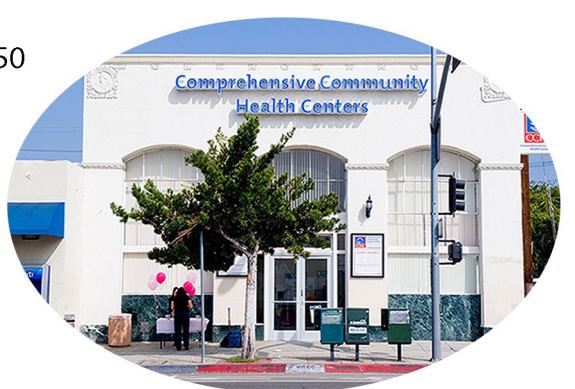
Highland Park 5059 York Blvd. Los Angeles, CA 90042

801 S. Chevy Chase Dr. #250 Glendale, CA 91205