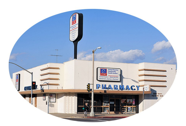
North Hollywood 12157 Victory Blvd. North Hollywood, CA 91606