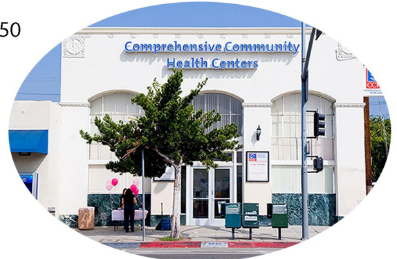
Highland Park 5059 York Blvd. Los Angeles, CA 90042

For more information about our services visit