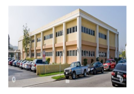
Glendale 801 S. Chevy Chase DR. Glendale, CA 91205

CCHC serves as a medical home to individuals and families across the life span, including the low-income and underserved. CCHC serves a large immigrant population including Latino, Armenian, and Asian populations. CCHC's health care providers speak the languages of the community.